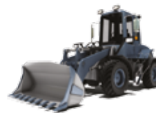
COMPACT WHEEL LOADERS